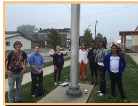
SHS (Big Red)