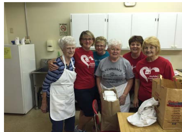
Some of the Chicken Grill Team-Thank you to everyone who helped and came for dinner!

KIDS ROCK IS RETURNING ON OCTOBER 11TH, 6:00-7:15 PM. THIS YEAR ACTIVITIES WILL INCLUDE SPECIAL MUSIC, BIBLE LESSONS, CHAPEL TIME, SKITS, PLAYS, AND LOTS OF FUN ACTIVITIES. PLEASE INVITE YOUR FRIENDS AND PLAN TO JOIN US THIS SUNDAY, OCTOBER 11TH.