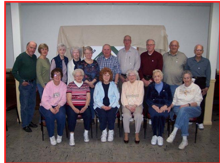
A LOOK BACK !