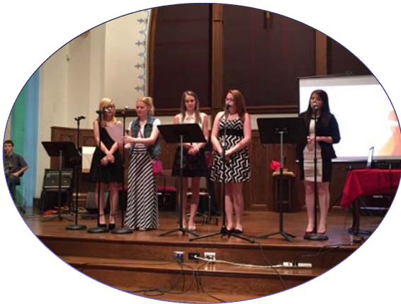
2015 Baccalaureate Service