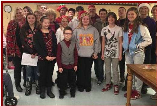
Distributing Gifts to Dixon Nursing Home

Feb. 21 “Brennan” The Movie Night! Come out and see this dynamic film chronicling the life story of author Brennan Manning who had a huge influence on the CCM artist Rich Mullins who wrote “Our God Is An Awesome God.” The cost is $10 per ticket. 6:00-7:45 P.M.