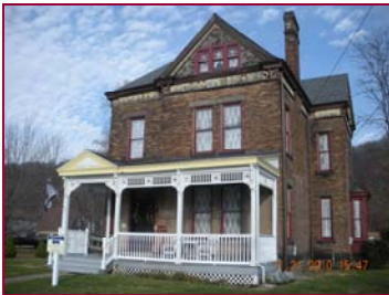
The Marshall House— New Cumberland, WV