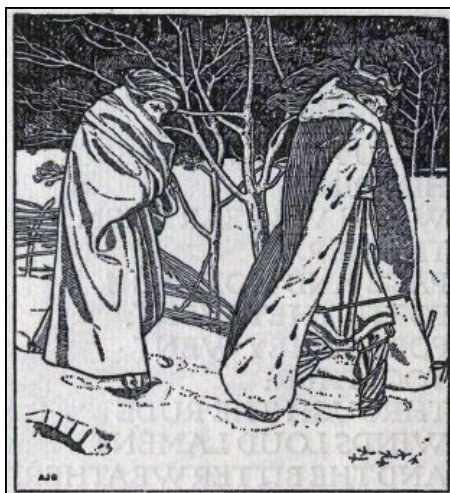
King Wenceslas and his page.

Good King Wenceslas looked out, On the Feast of Stephen, When the snow lay round about, Deep and crisp and even; Brightly shone the moon that night, Tho’ the frost was cruel, When a poor man came in sight, Gath’ring winter fuel.