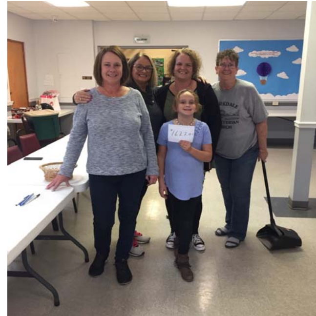
Rummage Sale Team