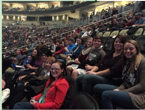
Chris Tomlin Concert Nov. 14th