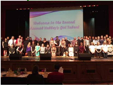
The Valley's Got Talent Nov. 8th

Dec. 10th- Christmas Caroling and Presents for Patients - Dixon Nursing home at 6:30 pm.